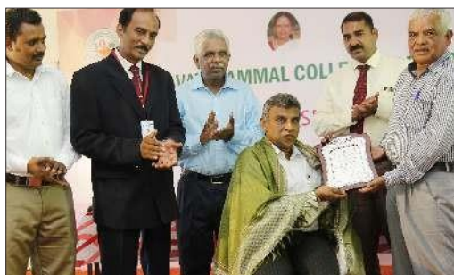
RVS Padmavathi Ammal College of Pharmacy celebrated World Pharmacist day 2017 at college auditorium.