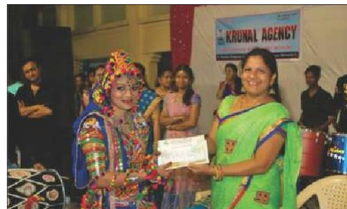
Shri Sarvajani Pharmacy College, Mehsana has organized Pharma Ramzat 2017 . All the present students, alumni members, teaching & non-teaching staffs of SSPC participated in aarti of goddess Ambaji, Dinner, RaasGarba and alumni meeting at evening after 6pm on 15th Sept 2017 to make the function memorable and full of joy.