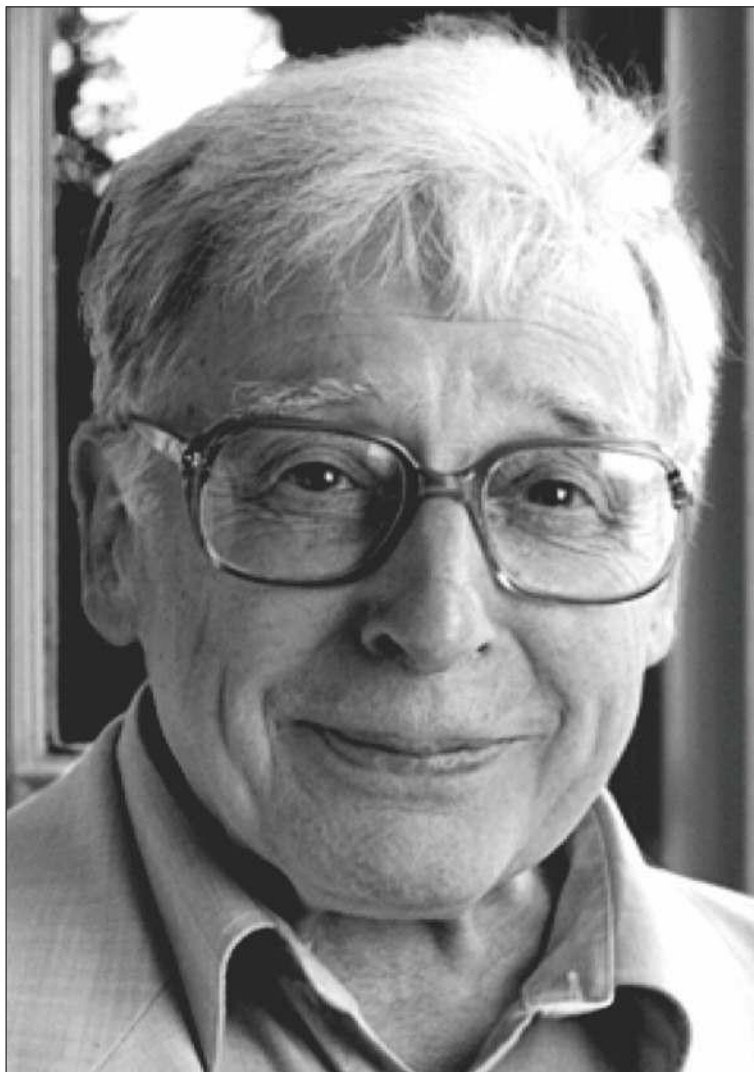
Robert G. Edwards

(Born: 27 September 1925, and Died: 10 April 2013)